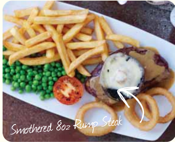
Smothered 8oz Rump Steak

Smothered 8oz Rump Steak £10.75 Topped with mushroom, peppercorn sauce and melting cheese, with chips, half a grilled tomato, peas and onion rings.