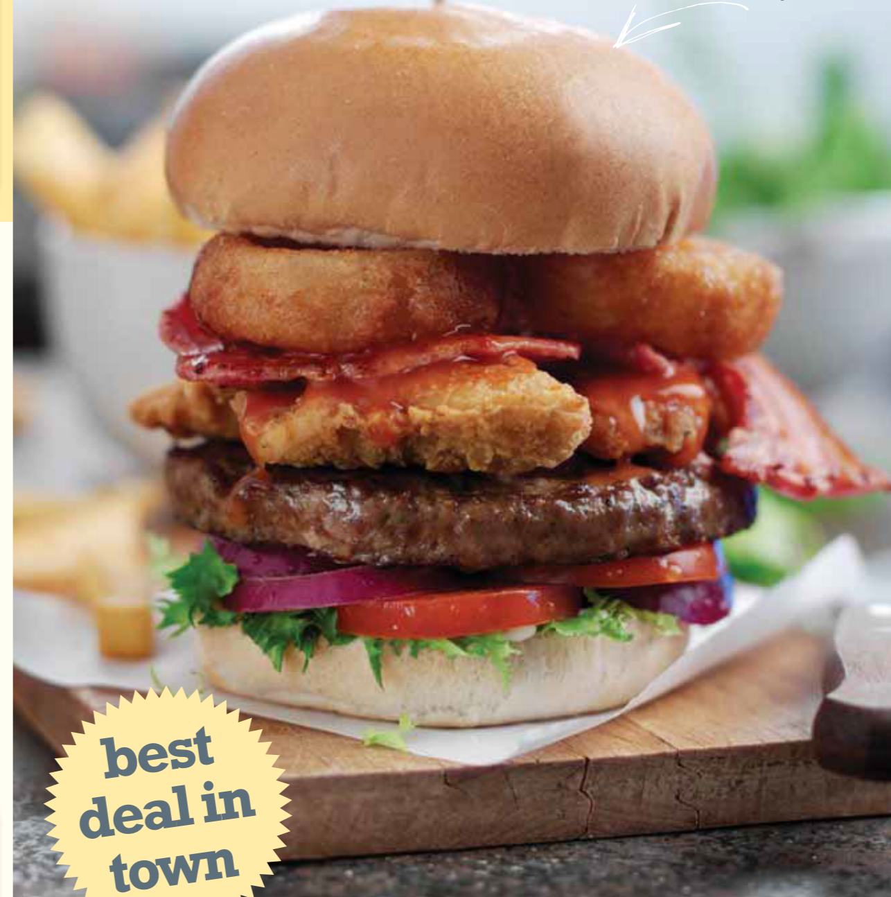
Towering Inferno Burger