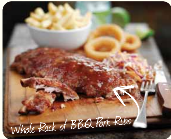
Whole Rack of BBQ Pork Ribs

Whole Rack of BBQ Pork Ribs £10.95 Served with coleslaw, onion rings and chips.