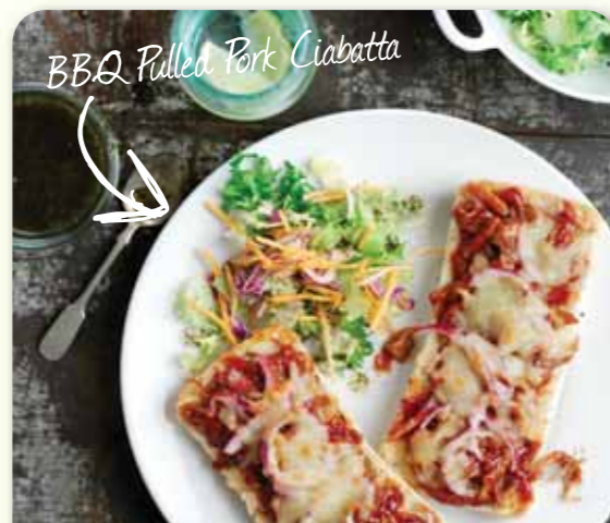
BBQ Pulled Pork Ciabatta

Why not add Spiral Fries for £1 or Chips for 50p?